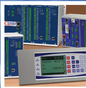
Monitoring and Control Solutions