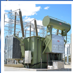
Power Transformers ( \geq 3\text{MVA} )