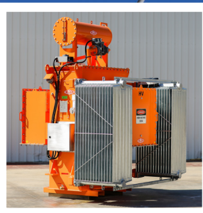
Distribution Transformers ( \leq 5\text{MVA} )