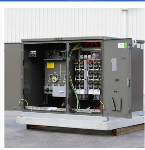
Compact MV Substations